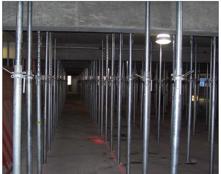
Post Shores can be used for supporting plywood decks or reshoring existing structures.

A telescoping tube provides rough height adjustment, in 3" increments, using a captured pin. A threaded collar provides fine height adjustment, in a 4" range, using a hinged handle. The Post Shore also includes a Quick-Release feature that relieves pressure so it can be quickly removed, relocated and reused.